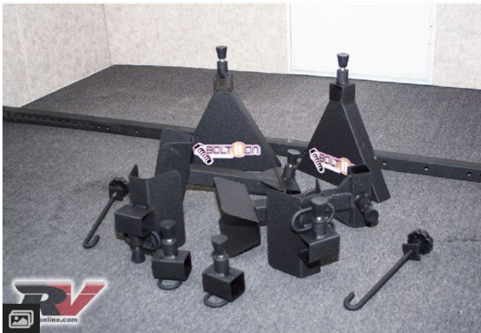
Photo 2/4 | Bolt It On's new bike restraining system was installed in less than 10 minutes. The Bolt It On Motorcycle Restraint System is available with two separate-sized tire stops. One is for wider, streetbike-style tires, while the other is designed for thinner, dirt-bike-style tires. Be sure to use the proper tire stop for your application. The one shown here is the thinner version.

In most cases, toy haulers come equipped with four basic recessed D-ring tie-down anchors, one at each corner of the garage area. This works well for securing heavier ATVs and UTVs. But when it comes time to transport motorcycles or dirt bikes, we must choose from a plethora of aftermarket devices intended to do just that.