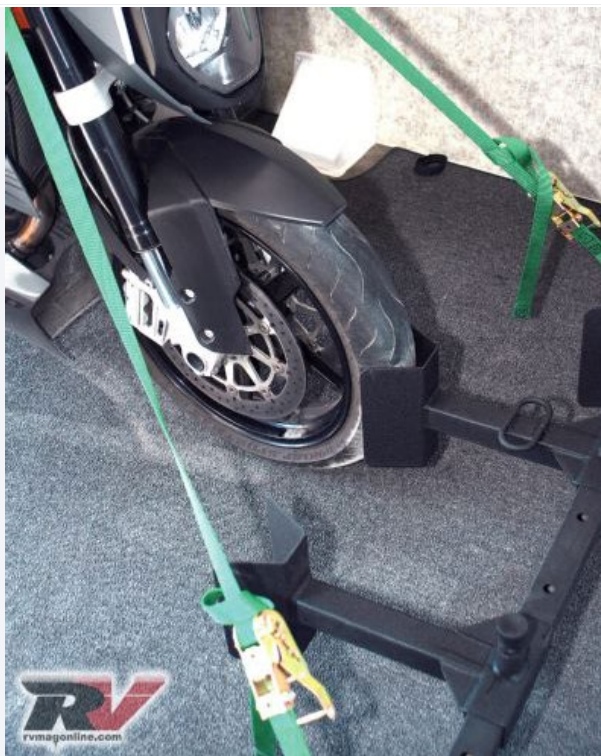
Photo 3/4 | Built out of tough carbon steel, the rack is treated with a durable wrinkle-texture black powdercoat, which should withstand many years of abuse. This is a good thing, because we figure someone will inevitably store the system outside in the elements when not in use.

It's available in four different configurations, able to secure two, four, six or even eight dirt bikes with no hassle whatsoever. The installation process reminded us of erecting one of those E-Z Up tents; simply slide the parts in place, tension the unit in place and snap the locking pins-you're ready to load motorcycles. It's that easy.